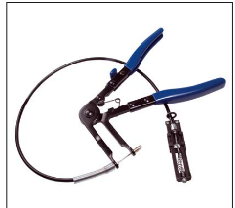
Spring Clamp – Flexible Ratchet Tool