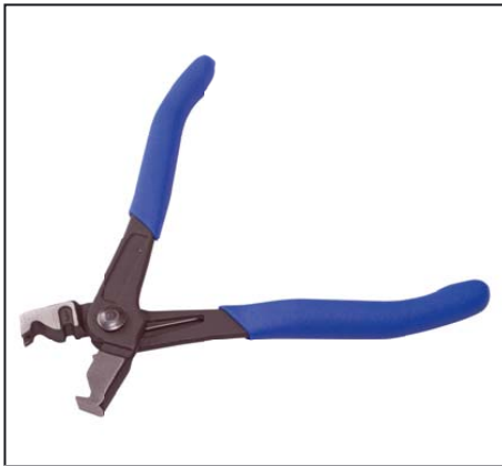
Ezyclik™-M/M+ – Vertical Tool