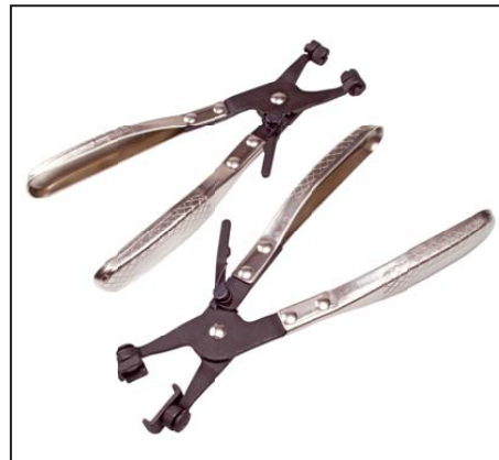
Spring Clamp – Tool Pack