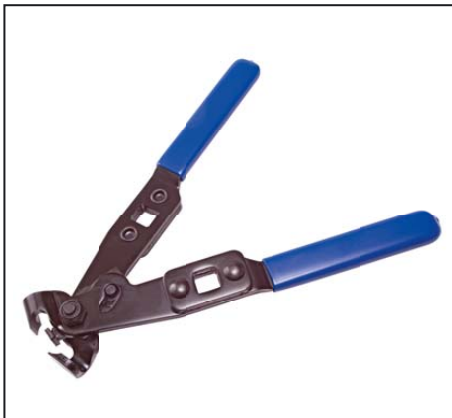
Ear Clamp – Vertical Tool