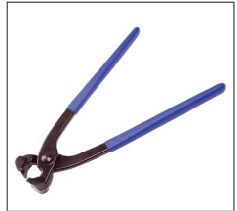
Ear Clamp – Vertical/Horizontal Tool